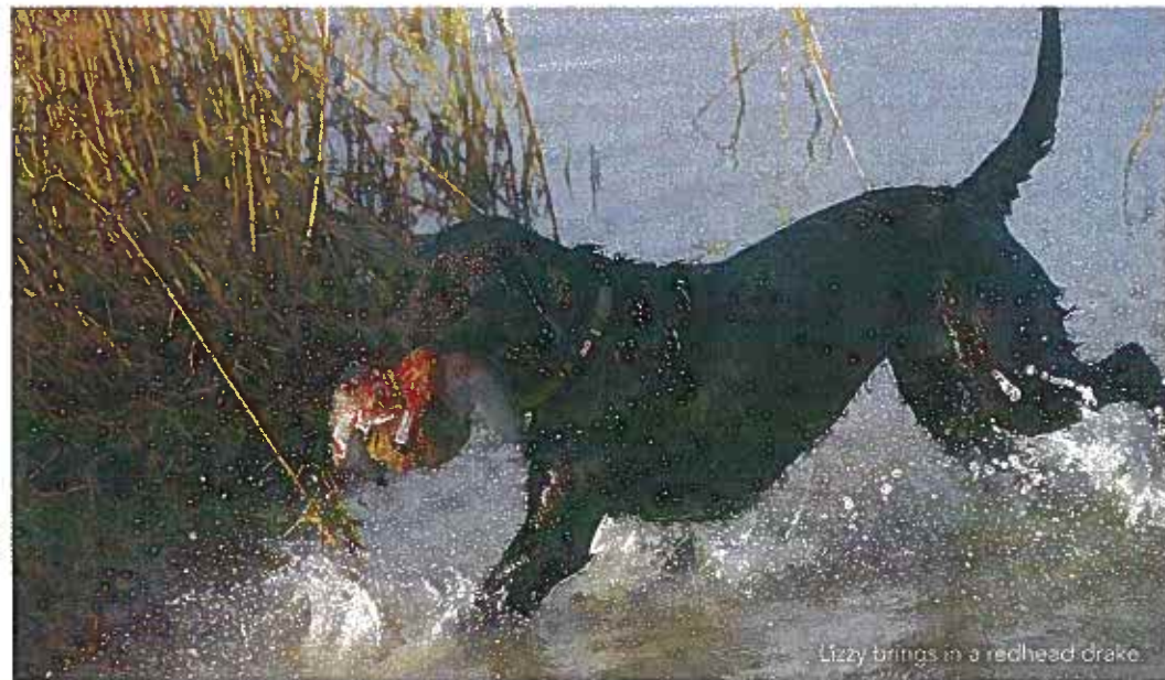
Lizzy brings in a redhead drake.