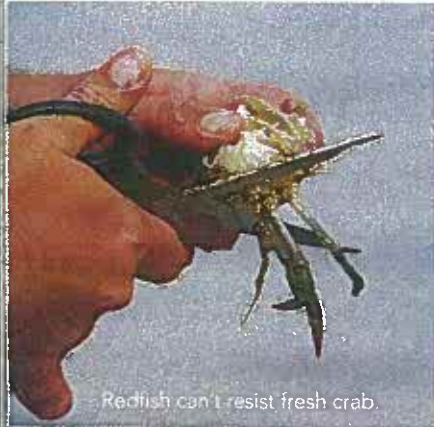
Redfish can't resist fresh crab.