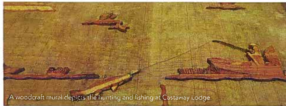
A woodcraft mural depicts the hunting and fishing at Castaway Lodge.